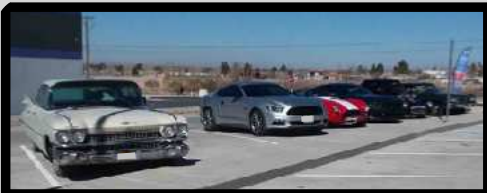
Provided by Dave W.

On a beautiful warm day, a couple club members participated in a Cruise on February 6, 2025 with other Car Owners. The cruise started in Canutillo, TX across from the Speedway gas station at 10:30 am, then they drove the scenic Country Road NM-28 to the Sonic Drive-In in East Anthony, TX. ~ Great conversation and good exercise for the cars !!! ~